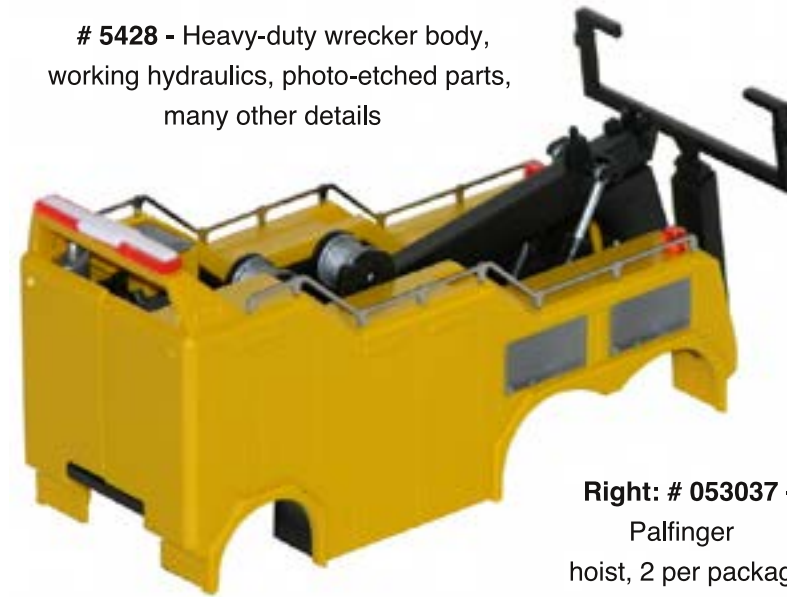
# 5428 - Heavy-duty wrecker body, working hydraulics, photo-etched parts, many other details