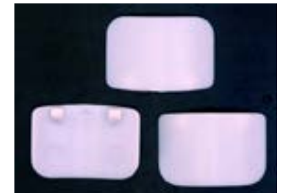
# 5372 - Airfoils for tractors (5)