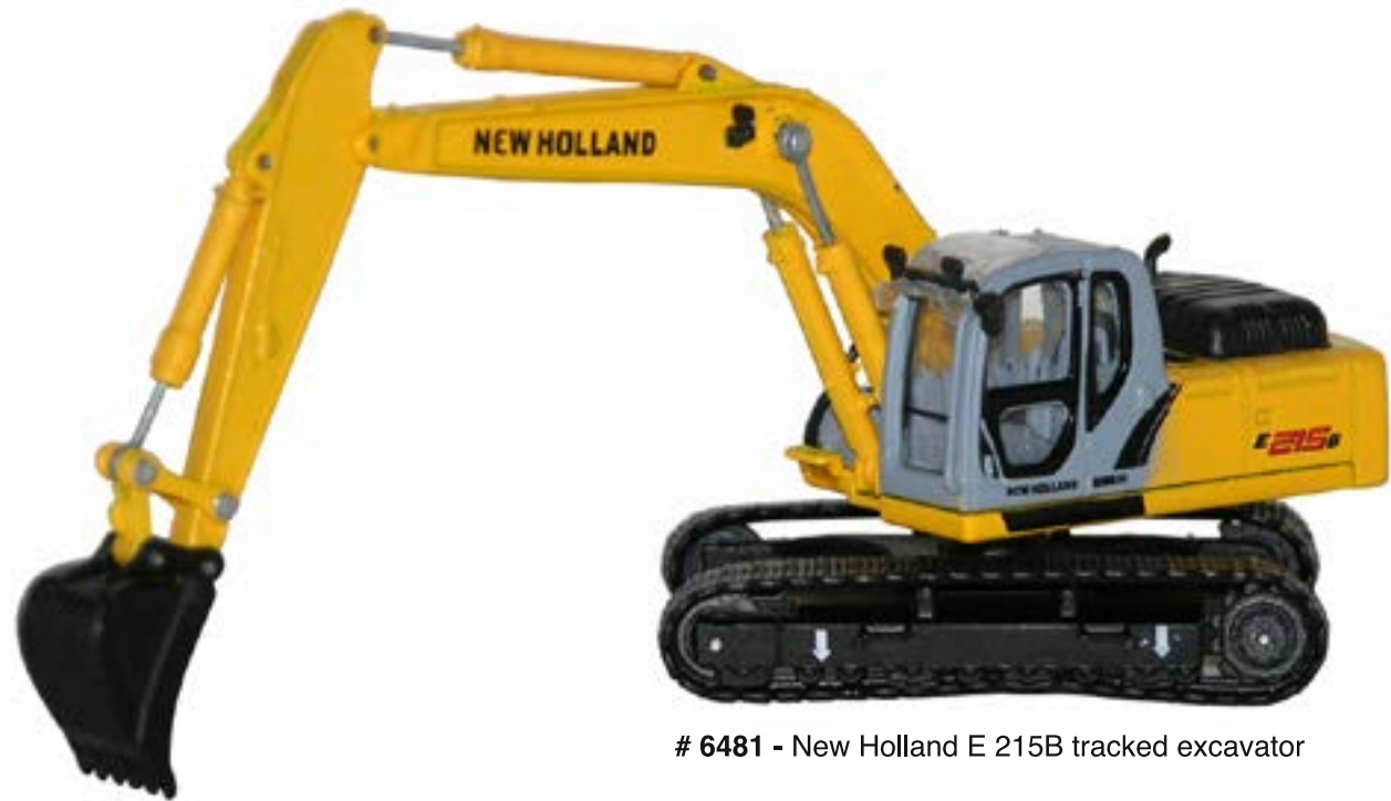
# 6481 - New Holland E 215B tracked excavator