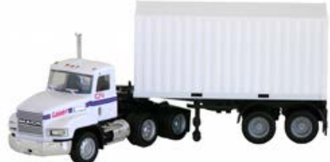
# 6468 - Mack 603 with 20' container trailer