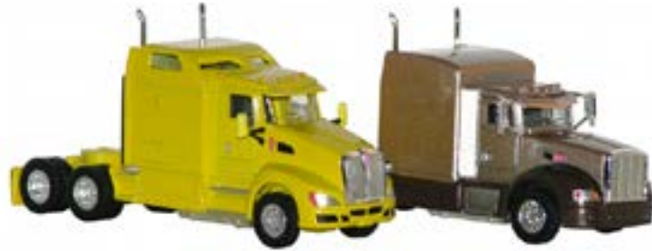
# 6462 - Peterbilt 386, Kenworth T-660 two-pack