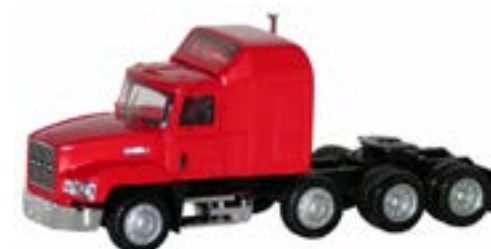
# 450030 - Lift-axle Mack tractor