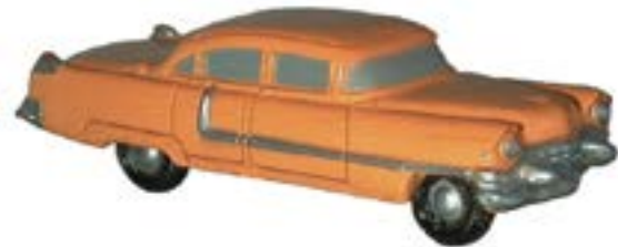
# 063201 - 4-door sedan (static model)