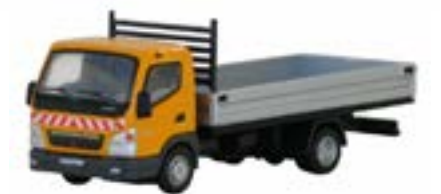
# 6447 - Mitsubishi FE, Sterling 360