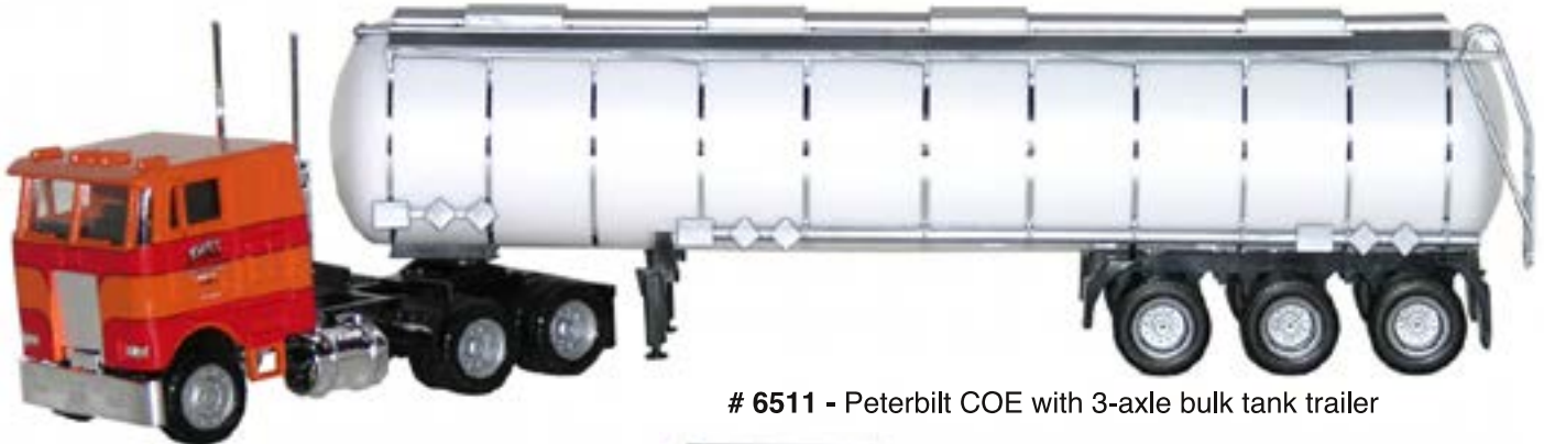
# 6511 - Peterbilt COE with 3-axle bulk tank trailer

Below: # 6529 - Multi-use Peterbilt tractor. The tractor is shipped with dual-drive. Included are parts to create a tri-drive or lift-axle tractor with the lift-axle either in the up or down position. Brand-new chrome wheels!