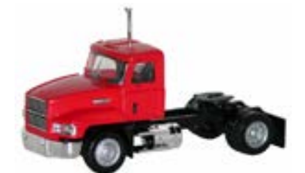
# 450010 - Single-drive Mack tractor