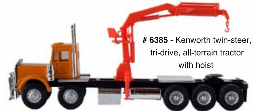
# 6385 - Kenworth twin-steer, tri-drive, all-terrain tractor with hoist