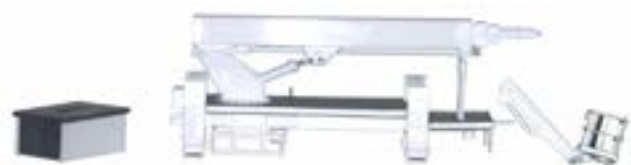
# 5453 - Boom structure, fully assembled