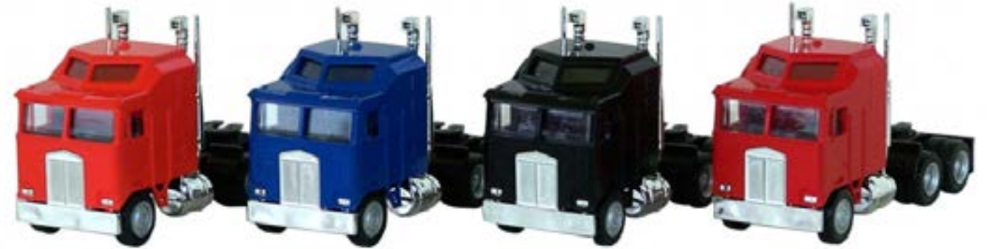
# 025258 - Kenworth K-100, 1-bar grill, painted. # 015258 - white version