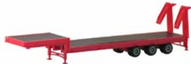
# 5433 - 3-axle equipment trailer #5436 - 2-axle version