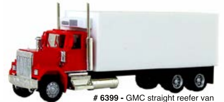
# 6399 - GMC straight reefer van