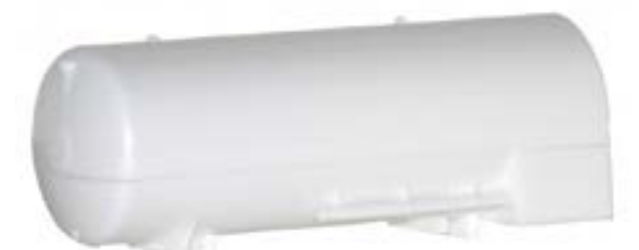
# 5437 - Propane tank superstructure