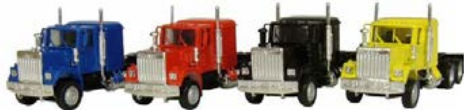
# 025235 - GMC General, long, painted. # 025234 - white