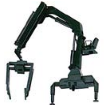
# 051507 - HIAB, palette fork