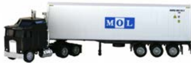
# 6440 - K-100 with 40' MOL reefer container