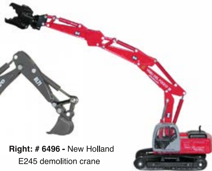
Right: # 6496 - New Holland E245 demolition crane