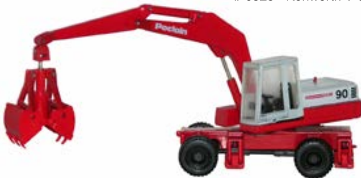
# 6520 - Poclain 90PB Heritage excavator