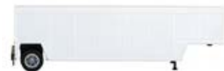
# 5330 - Beverage trailer