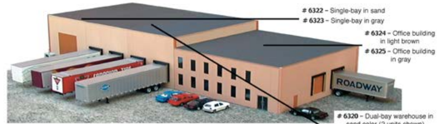
# 6322 - Single-bay in sand # 6323 - Single-bay in gray # 6324 - Office building in light brown # 6325 - Office building in gray