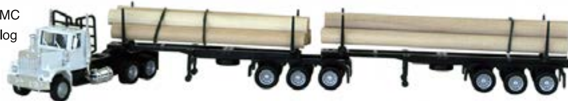
Right: # 6355 - GMC General Super B log hauler