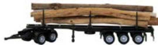
# 6428 - Australian logging truck with 2-axle dolly (logs are not included)