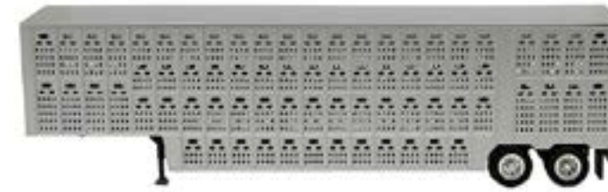
# 5354 - 48' cattle trailer, silver