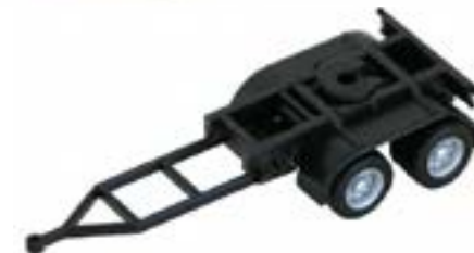
# 5443 - Converter with long draw bar