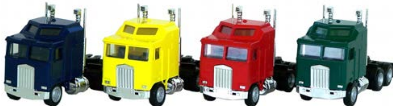
# 025257 - Kenworth K-100, 5-bar grill, painted. # 015257 - white version