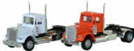
# 015254 - Single-drive FL, white # 015255 - Single-drive FL, painted