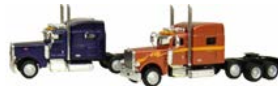
# 6434 - Peterbilt 389 with lift-axle