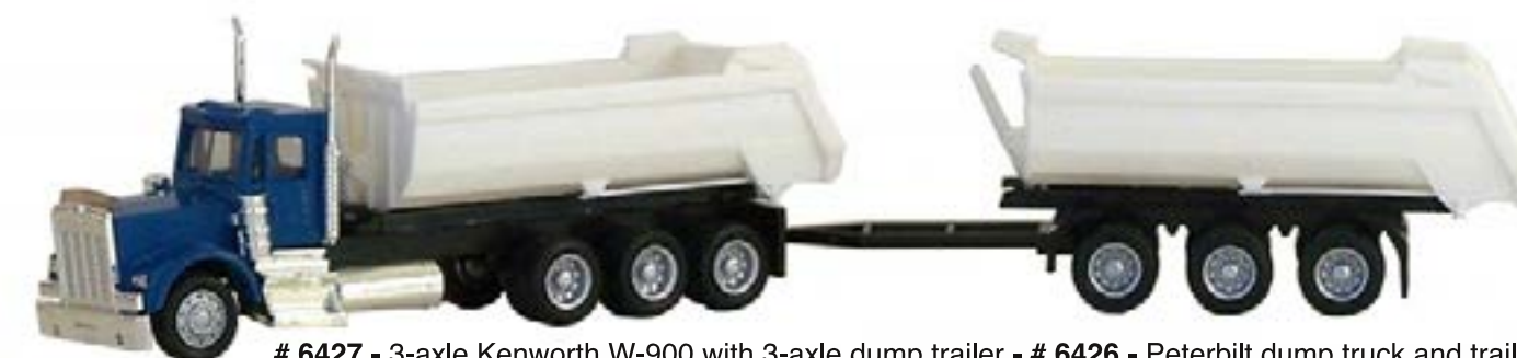
# 6427 - 3-axle Kenworth W-900 with 3-axle dump trailer - # 6426 - Peterbilt dump truck and trailer