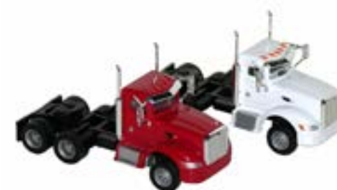
# 6476 - Peterbilt 386