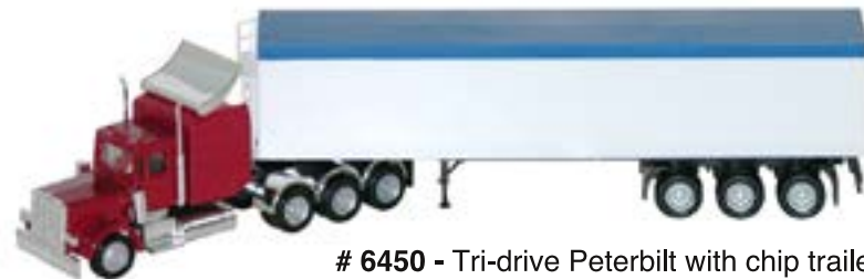
# 6450 - Tri-drive Peterbilt with chip trailer