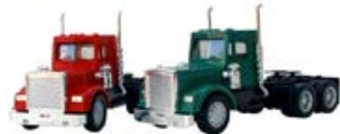
# 015278 - FL Classic, painted