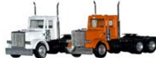
# 015285 - Peterbilt, new grill, painted # 015284 - Peterbilt, new grill, white