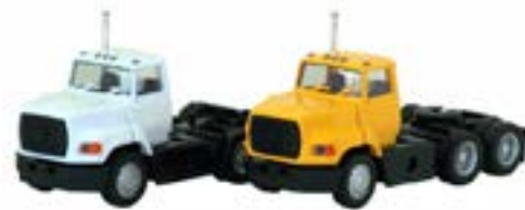
# 015241 - Ford L-9000, painted # 015240 - Ford L-9000, white