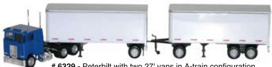
# 6329 - Peterbilt with two 27' vans in A-train configuration