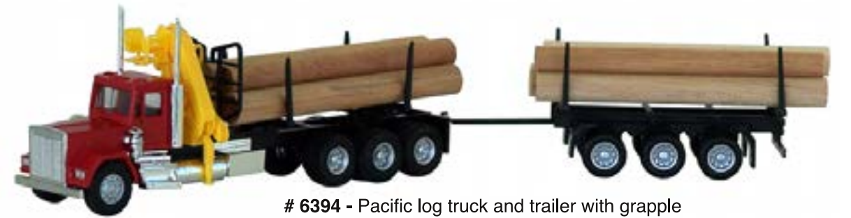
# 6394 - Pacific log truck and trailer with grapple