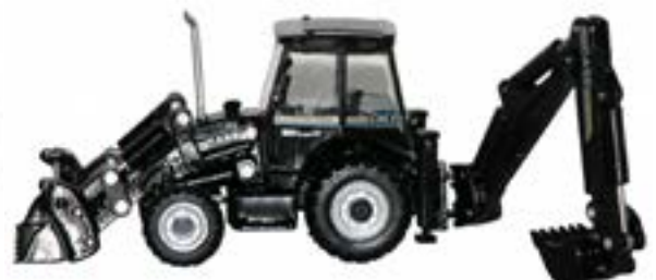
# 6521 - Case 590 Super R Black Hoe