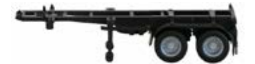
# 5440 - 20' container chassis