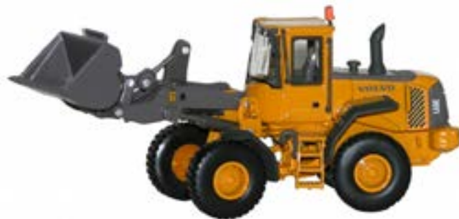
# 6497 - Volvo L60 loader