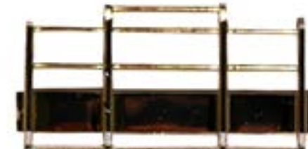
# 5370 - Chrome bull bars (3)