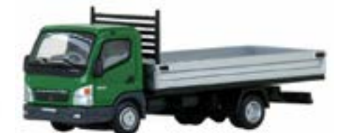
# 6420 - Mitsubishi FE, Sterling 360