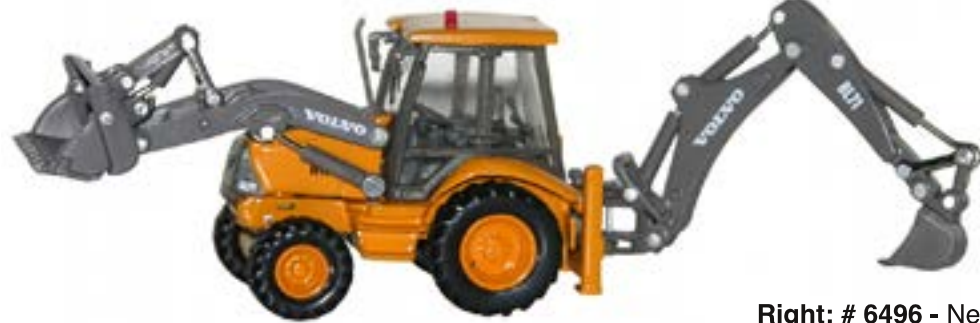
Below: # 6498 - Volvo BL 71 backhoe