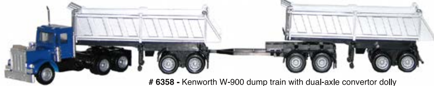
# 6358 - Kenworth W-900 dump train with dual-axle convertor dolly