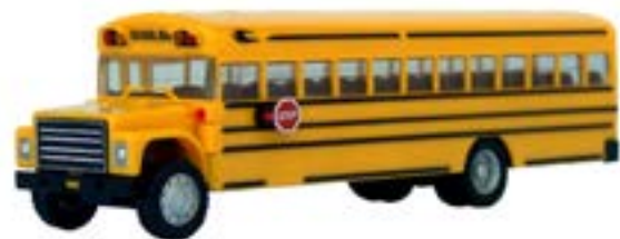
# 6100 - International school bus