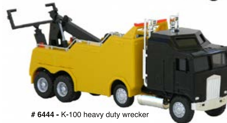
# 6444 - K-100 heavy duty wrecker