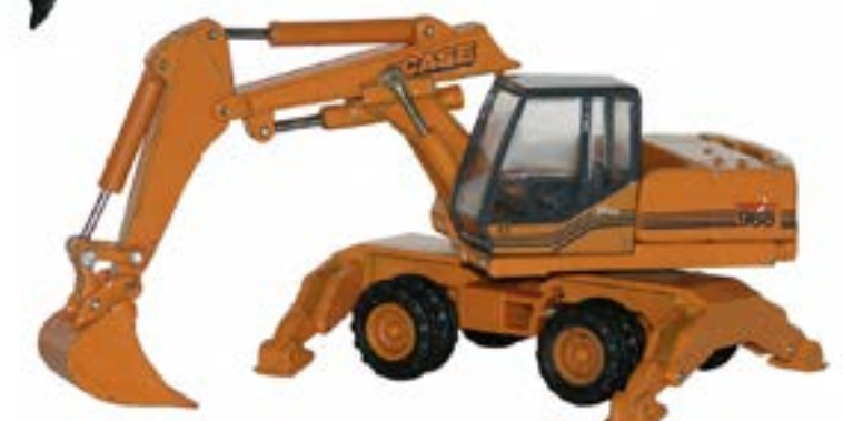
# 6489 - Case 988 hydraulic excavator