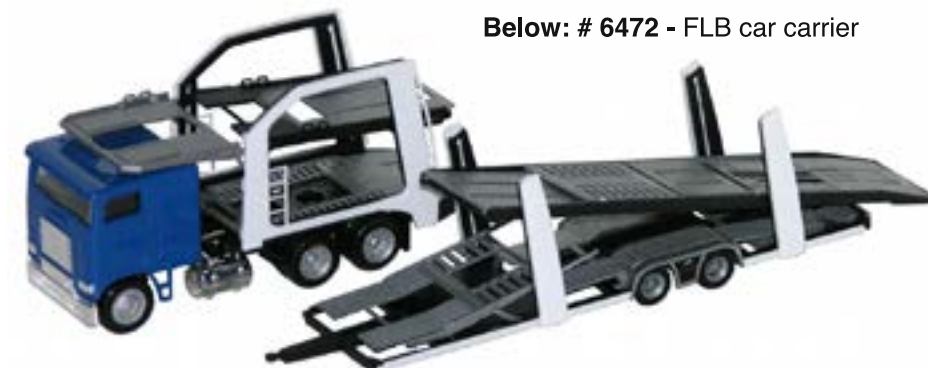
Below: # 6472 - FLB car carrier