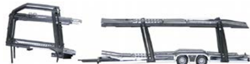
# 5445 - Car carrier superstructure and trailer