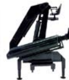
# 051484 - HIAB with hook