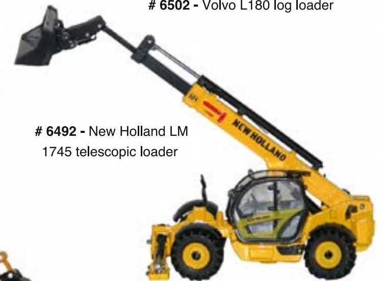
# 6492 - New Holland LM 1745 telescopic loader