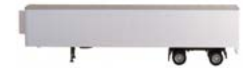
# 5417 - 53' spread-axle reefer van