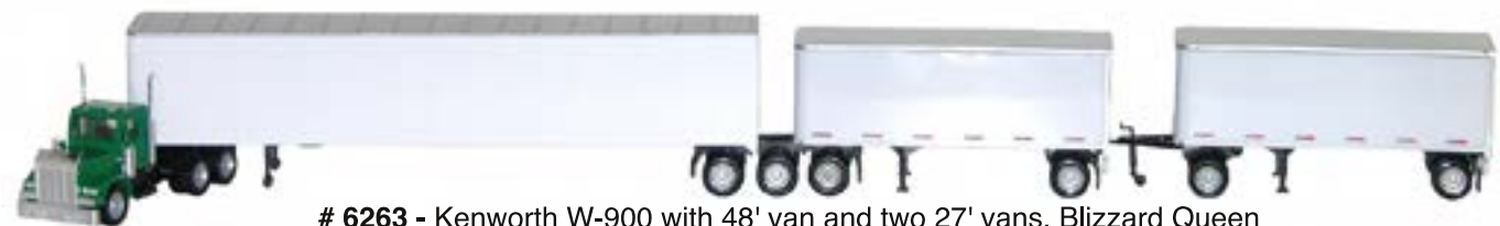
# 6263 - Kenworth W-900 with 48' van and two 27' vans, Blizzard Queen