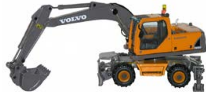
# 6490 - Volvo EW 180B excavator