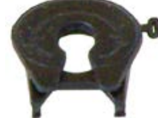
# 5313 - 10 5th wheels