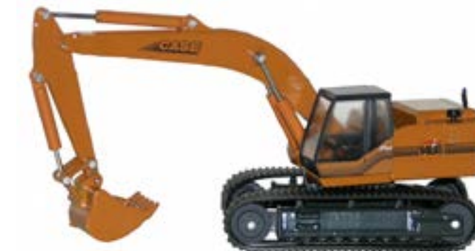
# 6485 - Case 1488 Plus tracked excavator