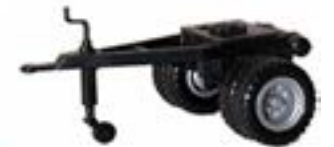
# 5274 - Single-axle converter