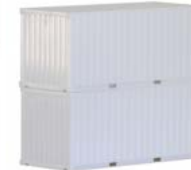
# 5441 - 20' container ( pack of 2)