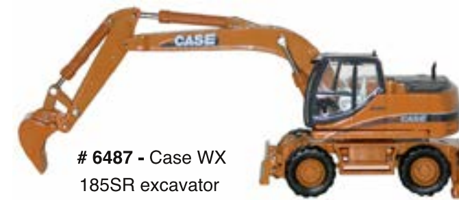
# 6487 - Case WX 185SR excavator