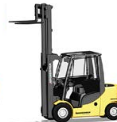
# 156660 - Forklift Jungheinrich 230s