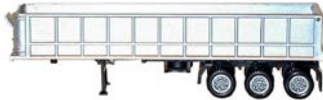
# 5340 - 36' dump trailer, 3-axle, # 5281 - 2-axle version