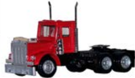
# 015276 - KW W-900, short, painted # 015275 - KW W-900, short, white