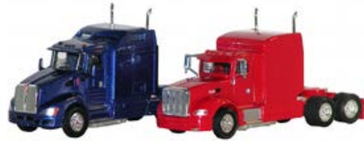
# 6463 - Peterbilt 386, Kenworth T-660 two-pack