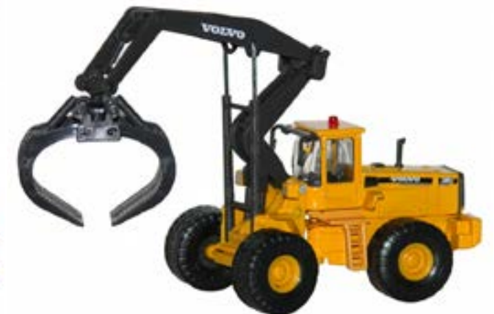
# 6502 - Volvo L180 log loader