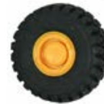
# 5439 - 6 loader wheels