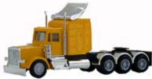
# 6374 - Tri-drive Peterbilt with chrome fenders