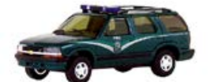
# 6400 - Fish and Wildlife SUV