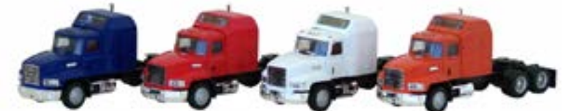
# 025264 - Mack 613, sleeper, painted. # 025263 - white