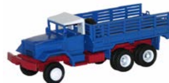
# 6461 - AM General M54 civilian