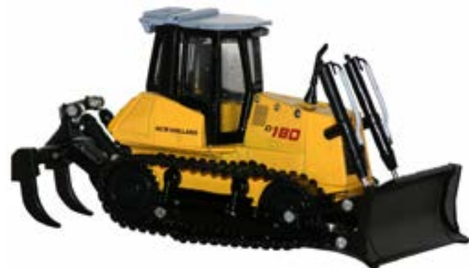
# 6512 - New Holland D180 bulldozer