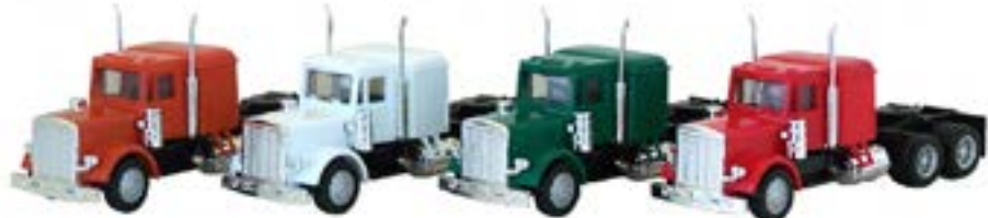
# 025233 - Peterbilt, long, painted. # 025232 - white