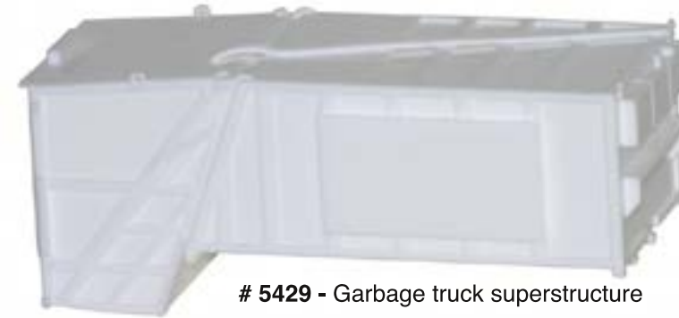
# 5429 - Garbage truck superstructure