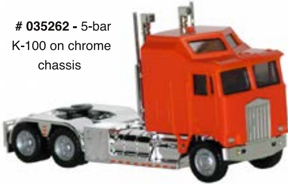
# 035262 - 5-bar K-100 on chrome chassis