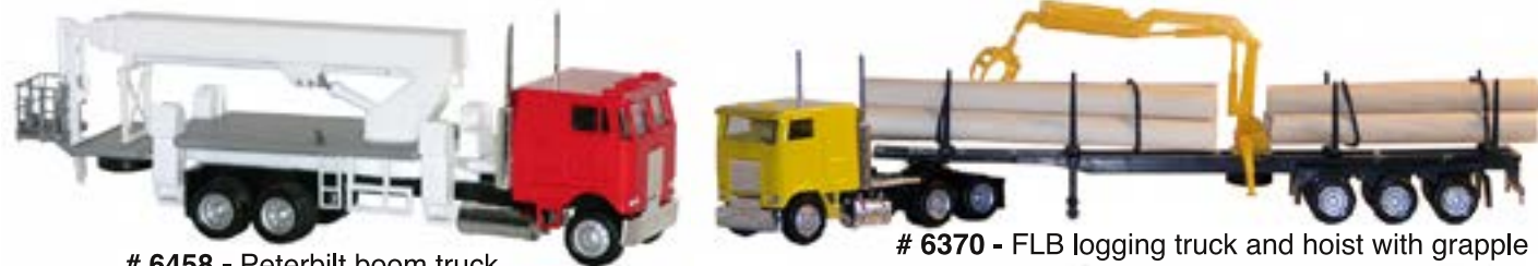
# 6458 - Peterbilt boom truck