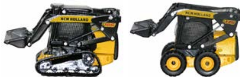
# 6500 - New Holland C185 # 6503 - New Holland L175 (1:50)