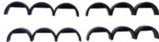
# 5385 - Pack of 4 triple fenders (black)