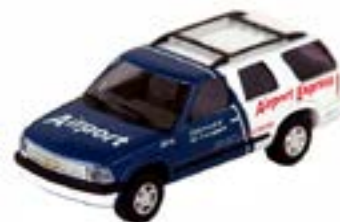
# 6401 - Airport Express