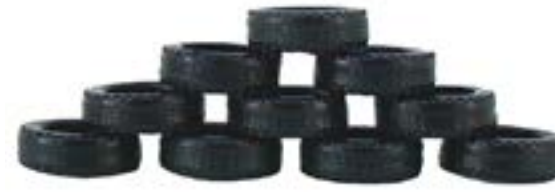
# 5358 - Package of 50 truck tires