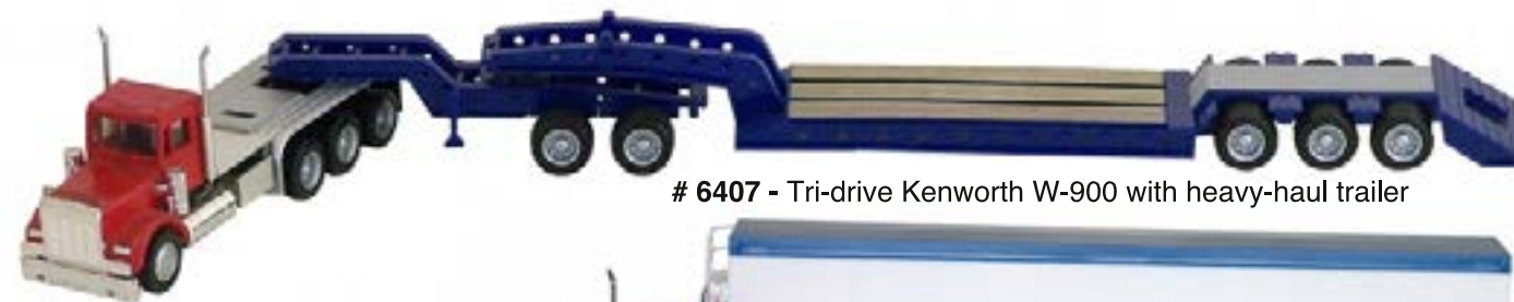
# 6407 - Tri-drive Kenworth W-900 with heavy-haul trailer