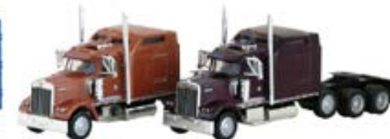
# 6432 - Kenworth W-900 with lift-axle