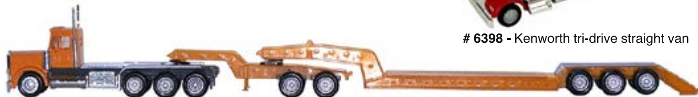
# 6377 - Peterbilt tri-drive with 3-axle heavy equipment trailer and 2-axle jeep dolly