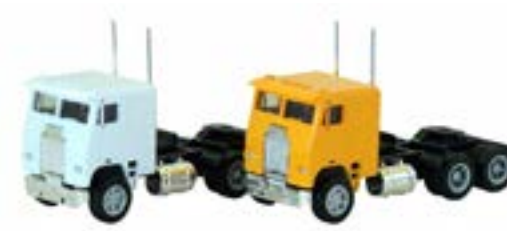
# 015238 - FL COE, white # 025238 - FL COE, painted