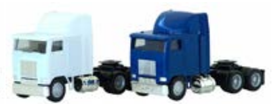
# 015248 - FLB with fairings, white # 025248 - FLB with fairings, painted