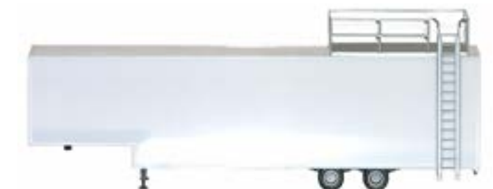
# 5431 - Race or horse transport trailer with viewing platform