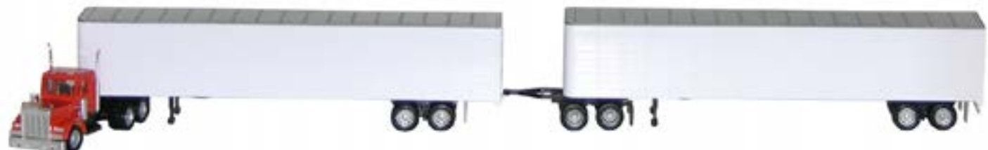
# 6314 - Kenworth W-900, two vans, 2-axle dolly, Turnpike Double