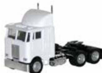
# 6310 - Peterbilt, air dam