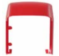
# 5324 - 3 air dams