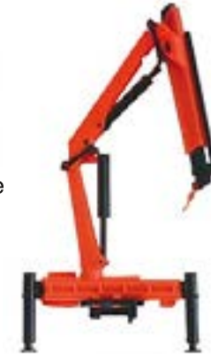
Right: # 053037 - Palfinger hoist, 2 per package