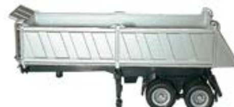
# 460000 - dual-axle version # 5288 - 26' gravel dump