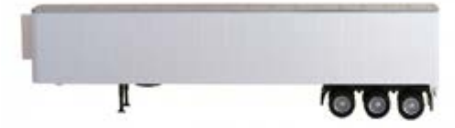
# 5419 - 53' 3-axle reefer van, Carrier reefer