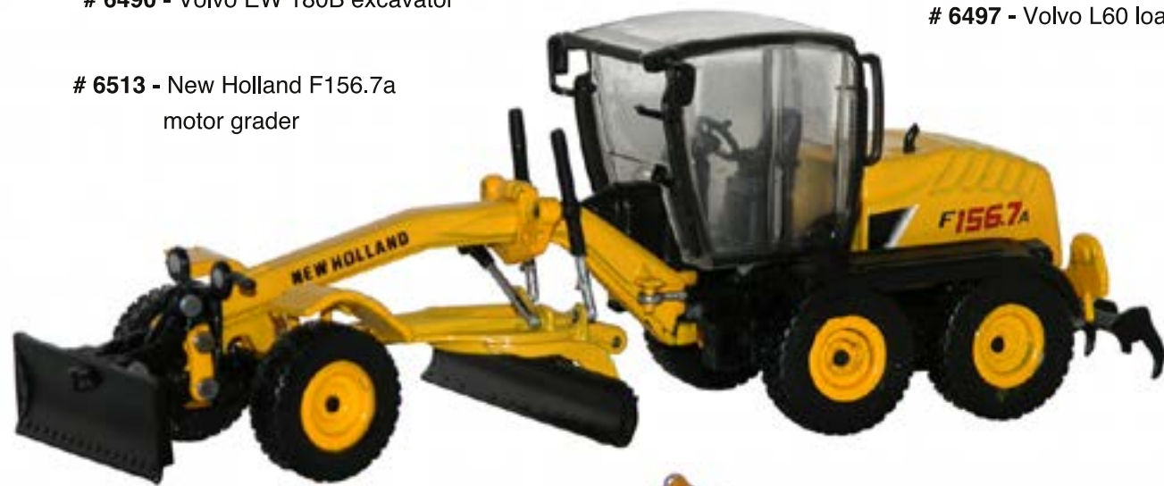
# 6513 - New Holland F156.7a motor grader