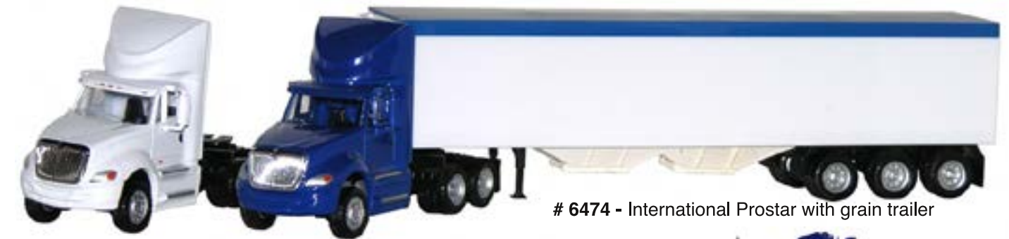
# 6474 - International Prostar with grain trailer