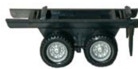
# 5300 - dual-axle chassis