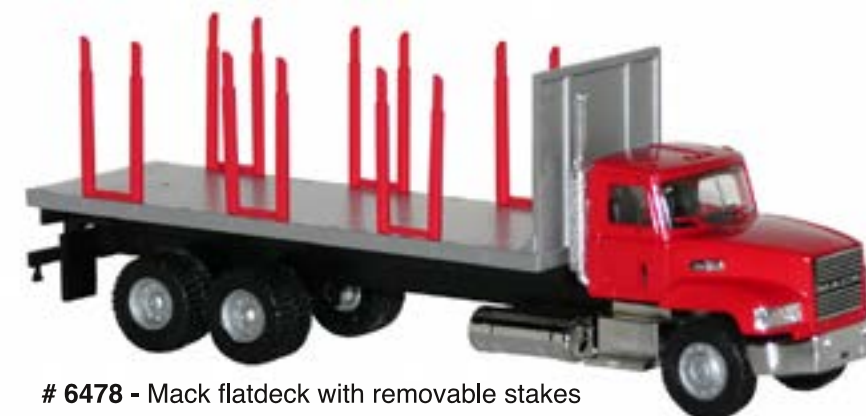
# 6478 - Mack flatdeck with removable stakes