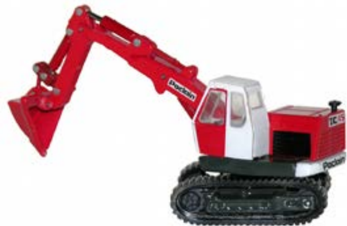
# 6486 - Poclair TC45 tracked excavator