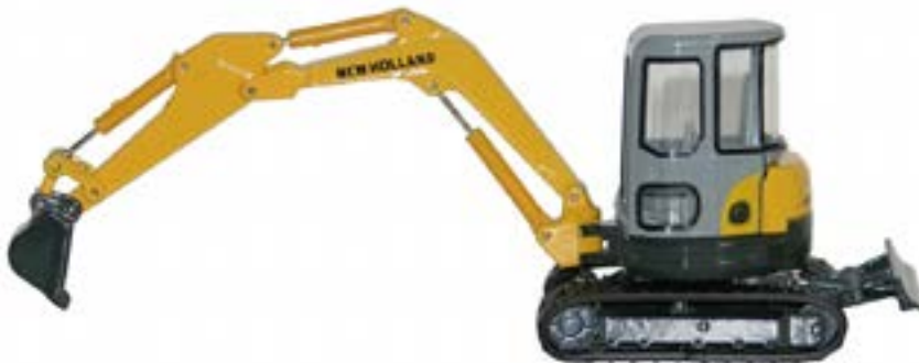
# 6518 - New Holland E502SR (1:50 scale)