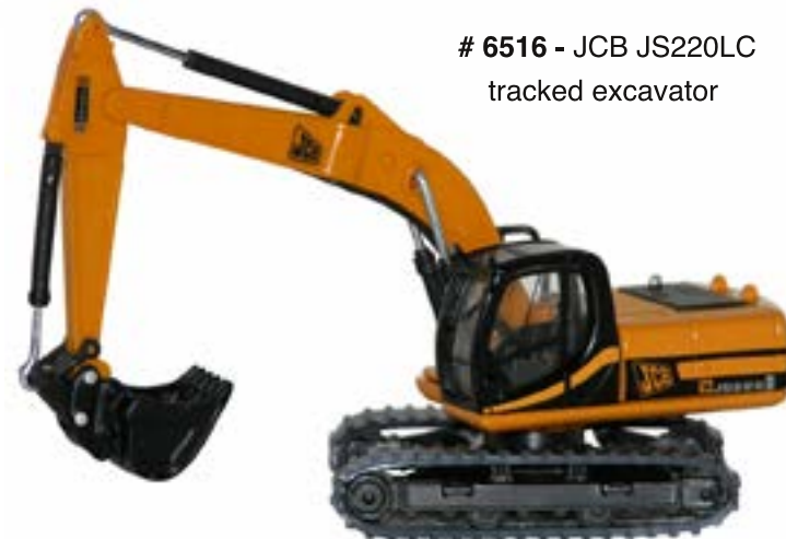
# 6516 - JCB JS220LC tracked excavator