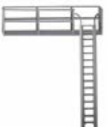
# 5432 - Viewing platform (2)