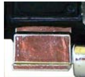
# 5424 - Peterbilt steps (3)