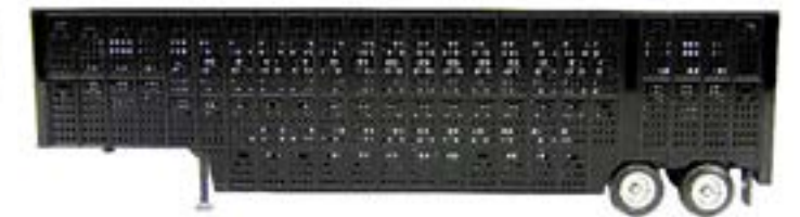
# 5355 - 48' cattle trailer, black