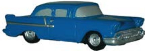
# 063214 - 2-door sedan (static model)