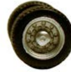
# 5338 - Low-profile duals (6)