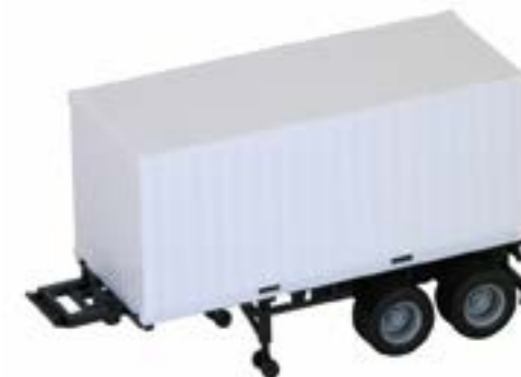
# 5442 - 20' container trailer