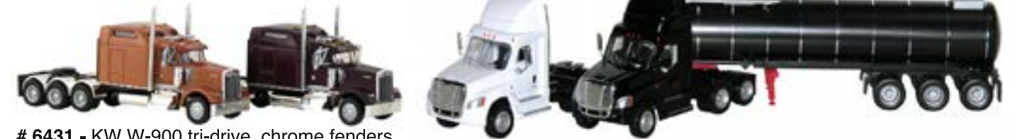
# 6431 - KW W-900 tri-drive, chrome fenders