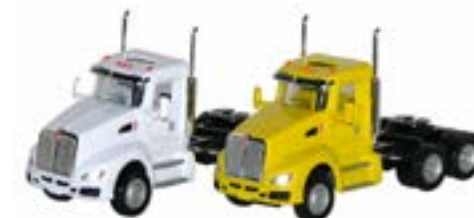
# 6477 - Kenworth T-660