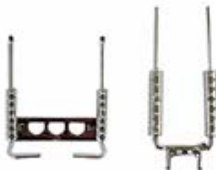
# 5408 - 8 stacks, 2 types