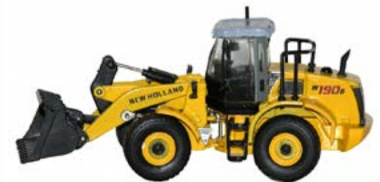
# 6493 - New Holland W190B loader