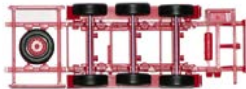
# 5361 - Trailer chassis (2)