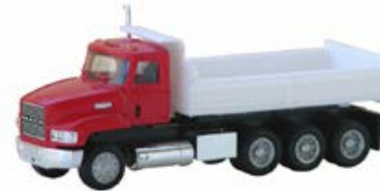
# 6378 - Mack, tri-axle dump truck