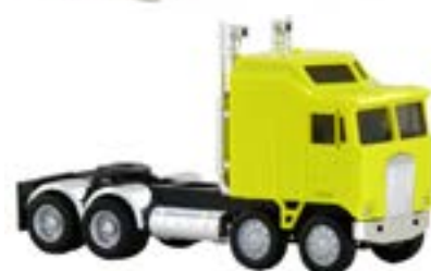
# 6442 - Twin-steer K-100 (5-bar grill)