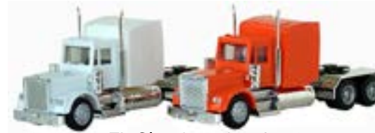
# 025252 - FL Classic, painted. # 025251 - white