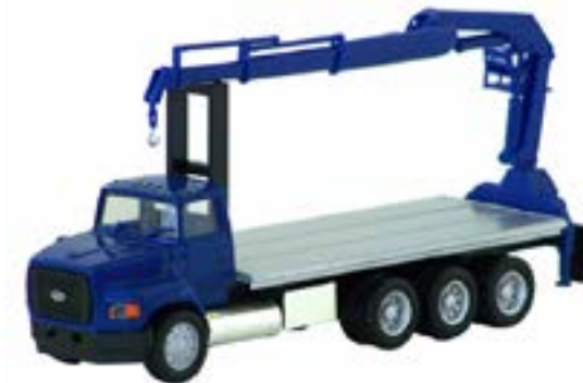
# 6379 - L-9000 straight truck, hoist