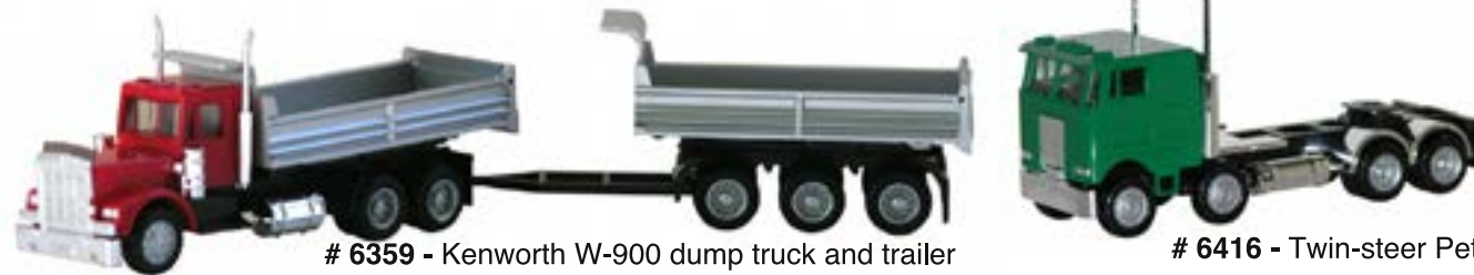
# 6359 - Kenworth W-900 dump truck and trailer