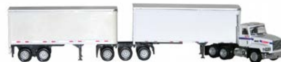
# 6413 - Mack 603 with B-train pup trailers