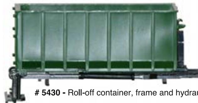
# 5430 - Roll-off container, frame and hydraulics