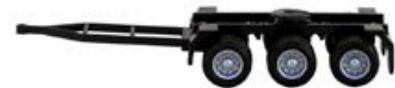
# 5399 - Triple-axle converter dolly