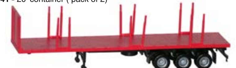
# 5456 - Flatbed trailer with removable stakes