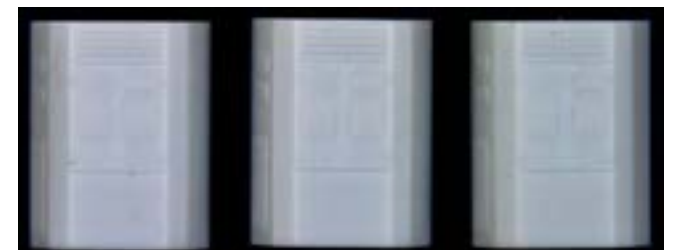
# 5369 - Three modern reefer units