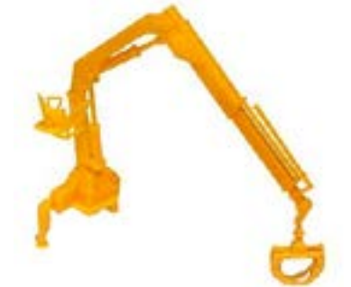
# 051491 - HIAB with grapple