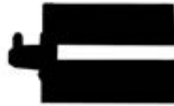
# 5373 - Package of 5 hooks