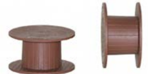
# 5438 - Wooden cable spools (6)