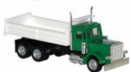
# 6252 - Peterbilt dump truck