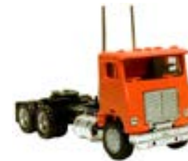
# 025237 - White 3-axle, painted # 015237 - White 3-axle, white