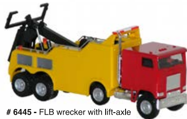
# 6445 - FLB wrecker with lift-axle