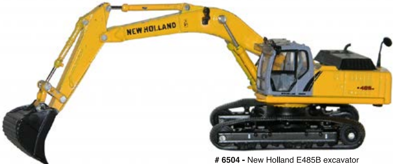
# 6504 - New Holland E485B excavator