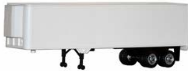
# 5271 - 40' reefer van