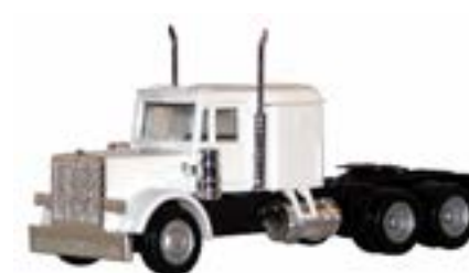
# 025284 - Peterbilt, new grill, white