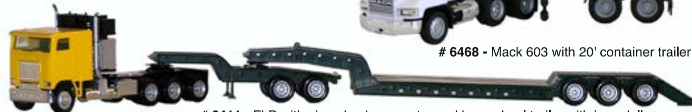
# 6411 - FLB with piggy-back generator and heavy-haul trailer with jeep dolly