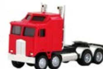
# 6441 - K-100 (1-bar grill)