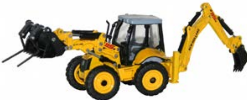
# 6514 - New Holland B115B backhoe