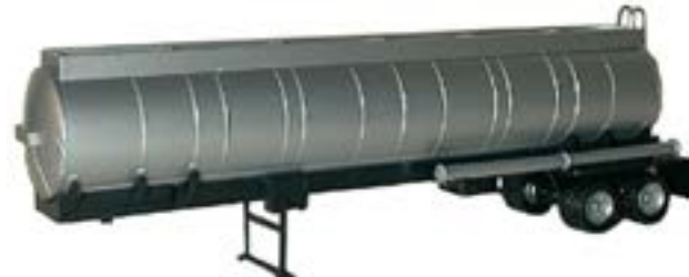
# 5287 - Chemical tank trailer # 5350 - 3-axle version