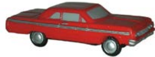
# 063227 - 2-door coupe (static model)