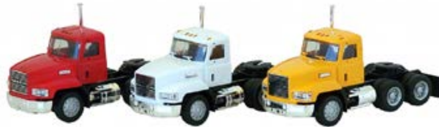
# 015264 - Mack 603, short, painted. # 015263 - Mack 603, white