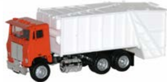
# 6446 - White Rd. Commander garbage truck