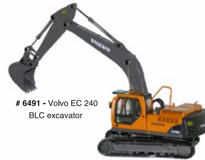
# 6491 - Volvo EC 240 BLC excavator