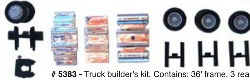
# 5383 - Truck builder's kit. Contains: 36' frame, 3 rear and 1 front axle assemblies, 5th wheel, tank, battery box, steps