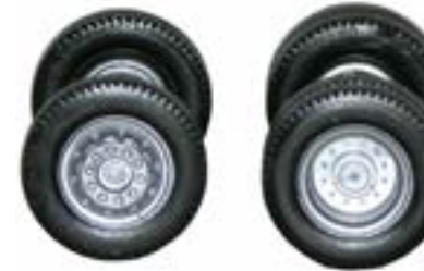
# 5450 - Truck wheels: 4 duals, 2 singles