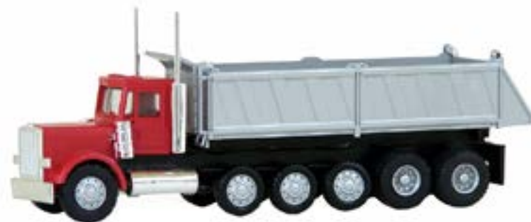
# 6417 - W-900 Super Dump, all-terrain drive tires, 3-lift axles