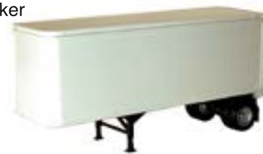
# 5273 - 27' van