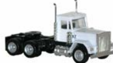
# 015252 - Pacific tractor white # 015253 - Pacific tractor painted