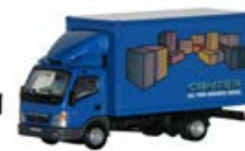
# 6471 - Mitsubishi van - blue