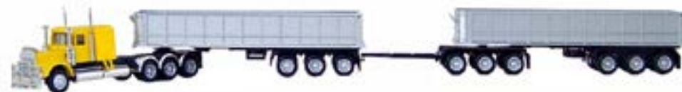
# 6418 - Kenworth W-900, Australian dump road train