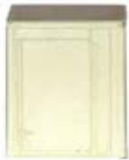
# 5401 - Drom unit