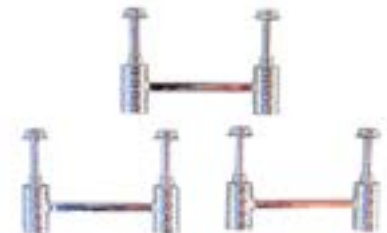
# 5387 - Package of 3 snorkel breathers