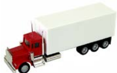
# 6398 - Kenworth tri-drive straight van