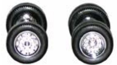
# 5449 - Chrome truck wheels