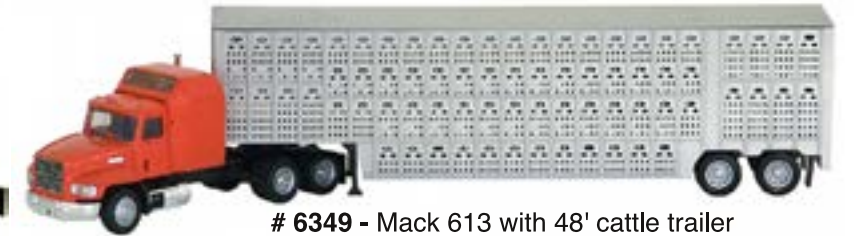
# 6349 - Mack 613 with 48' cattle trailer