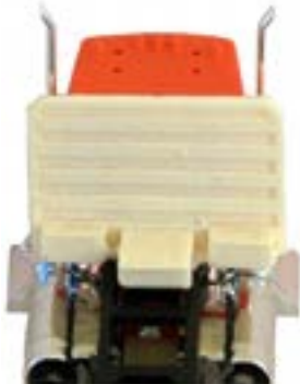
# 5421 - Headache racks, resin, (2)