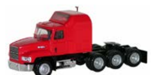
# 450020 - Tri-axle Mack tractor