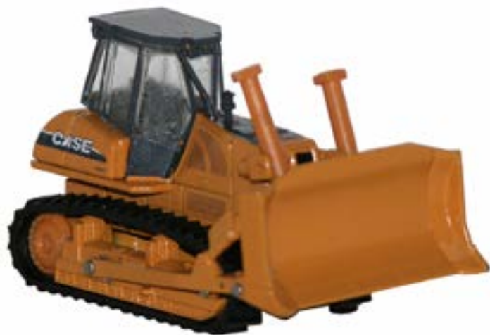
# 6484 - Case 1850K bulldozer