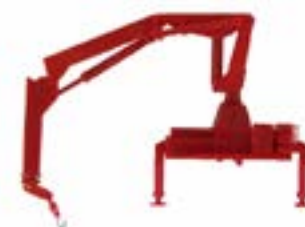
# 5395 - Small hoist