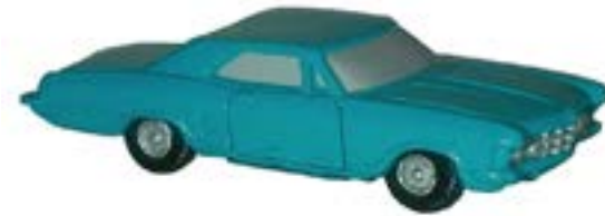
# 063230 - 2-door coupe (static model)