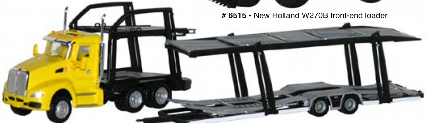
# 6523 - Kenworth T-660 auto carrier