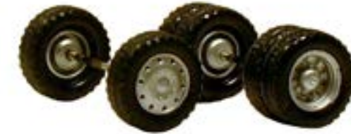
# 5337 - Silver Budds: 8 duals, 2 singles