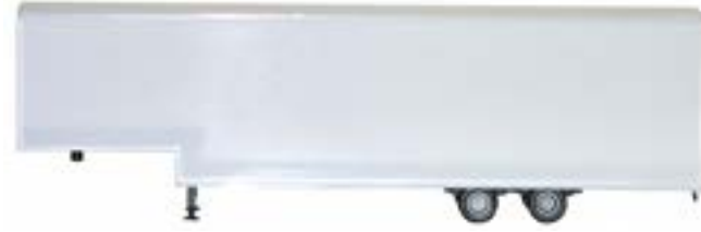
# 5434 - Drop deck moving van