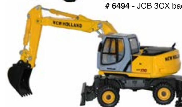
# 6480 - New Holland WE170 excavator