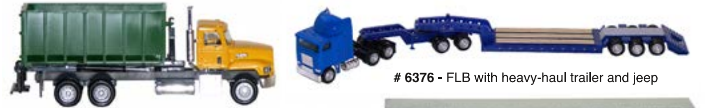
# 6443 - Mack with roll-off container