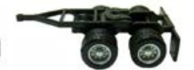
# 460010 - Dual-axle converter