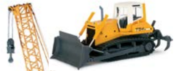
Above: # 151689 - Liebherr bulldozer PR 734