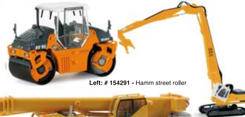
Left: # 154291 - Hamm street roller