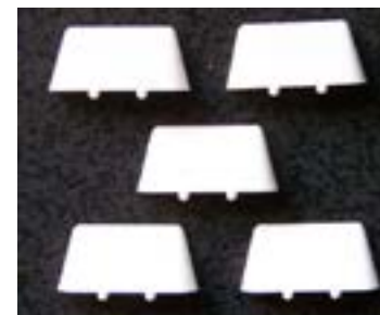
# 5381 - Airfoils for tractors (5)