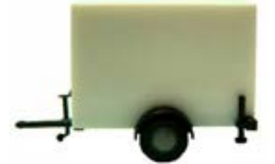
# 5378 - Utility trailer