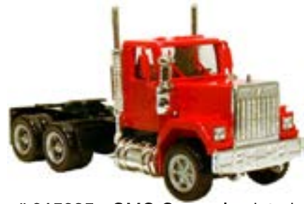
# 015235 - GMC General painted # 015234 - GMC General white