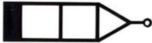
# 5367 - Package of 3 12' draw bars