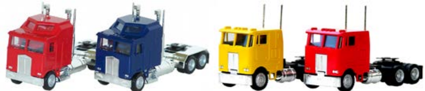
# 035260 - K-100, chrome, ptd. # 035259 - white version # 025246 - Peterbilt COE, painted. # 015246 - white