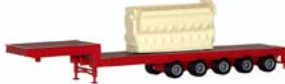
# 5402 - 16 cyl. engine (resin), trailer not included