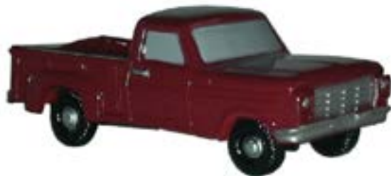
# 063256 - Pick-up truck (static model)