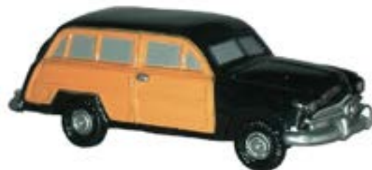
# 063269 - Station wagon (static model)