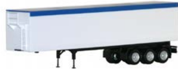
# 5435 - Wood chip trailer