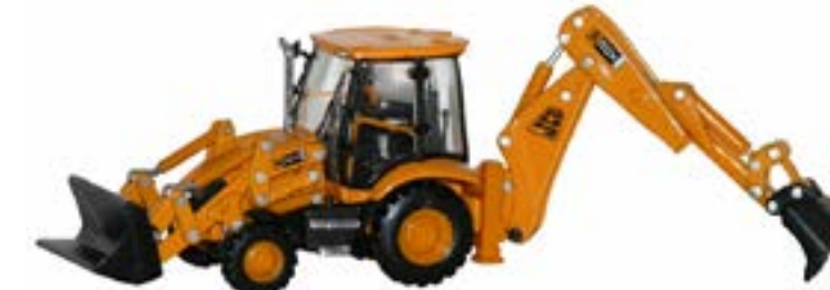
# 6494 - JCB 3CX backhoe