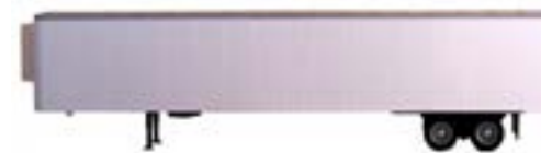
# 5414 - 53' 2-axle reefer van, Carrier