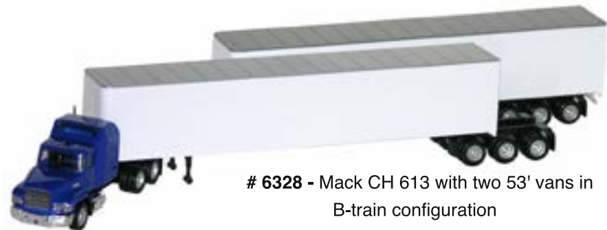
# 6328 - Mack CH 613 with two 53' vans in B-train configuration