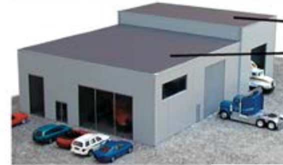
# 6323 - Single-bay warehouse in gray # 6322 - Single-bay warehouse in sand # 6327 - Dealership building in gray # 6326 - Dealership building in light brown