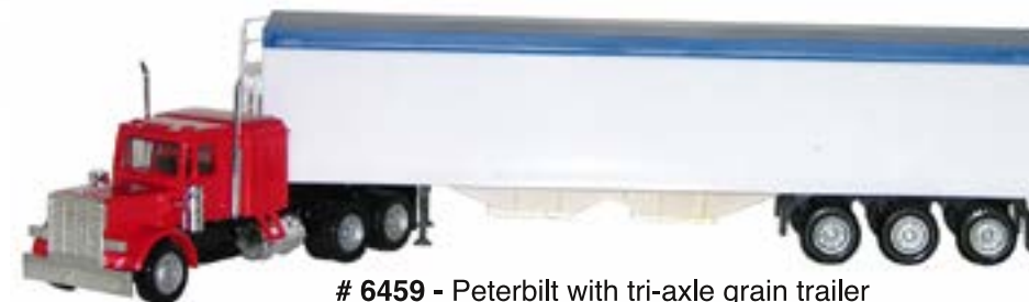
# 6459 - Peterbilt with tri-axle grain trailer