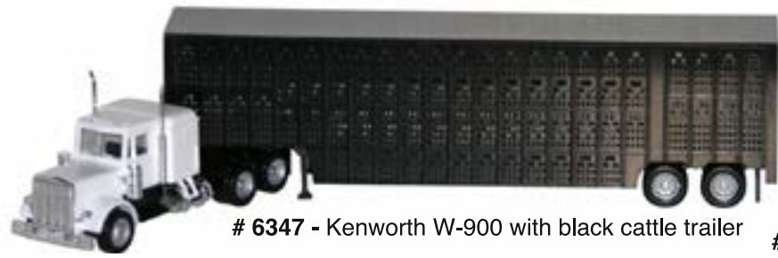
# 6347 - Kenworth W-900 with black cattle trailer