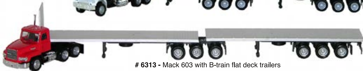
# 6313 - Mack 603 with B-train flat deck trailers