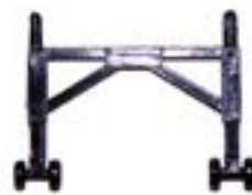
# 5389 - Trailer stands with wheels (5)