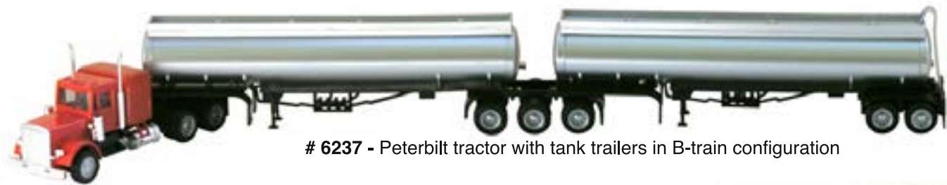
# 6237 - Peterbilt tractor with tank trailers in B-train configuration