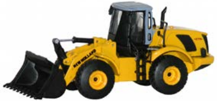
# 6515 - New Holland W270B front-end loader