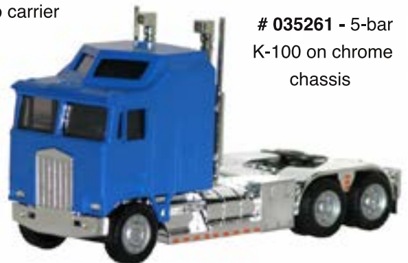
# 035261 - 5-bar K-100 on chrome chassis