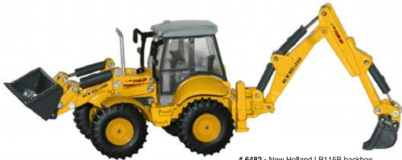
# 6482 - New Holland LB115B backhoe