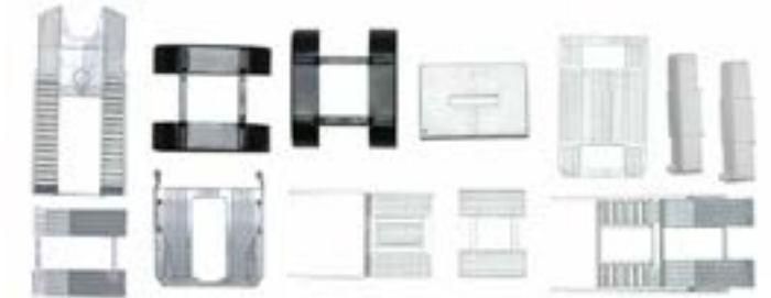
# 5451 - Ramps, radiators, fenders, platforms