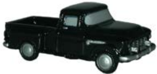
# 063243 - Pick-up truck (static model)