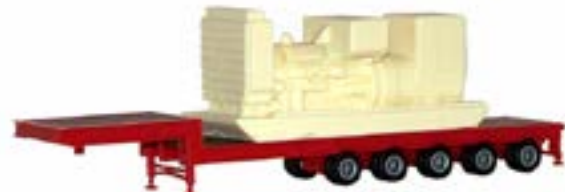
# 5403 - Generator unit (resin), trailer not included