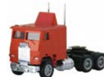
# 025239 - Super Cab FL COE