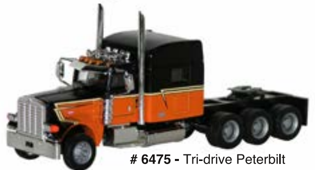
# 6475 - Tri-drive Peterbilt

In Canada: Box 219, Altona, MB R0G 0B0 In the USA: P.O. Box 184, Neche, ND 58265