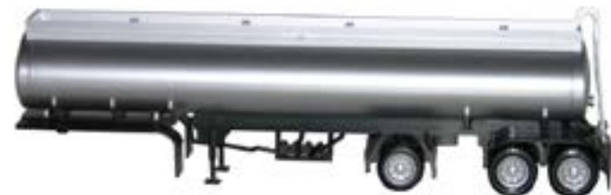
# 5351 - Tag-axle gasoline tanker, # 5353 - 3-axle version # 5275 - 2-axle gasoline tanker