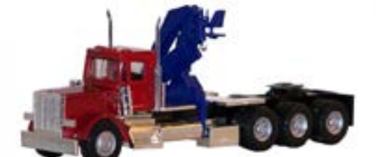
# 6373 - Peterbilt tri-drive with hoist