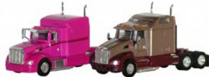
# 6464 - Peterbilt 386, Kenworth T-660 two-pack