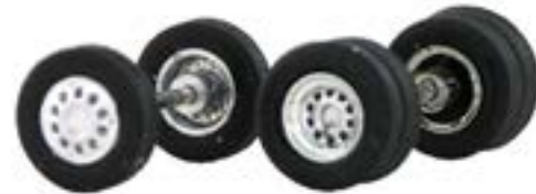
# 5426 - TNS chrome wheels: 2 fronts, 4 rears