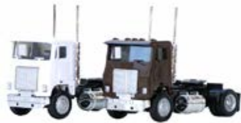
# 015236 - White Rd. Commander, white # 025236 - White Rd. Commander, ptd.