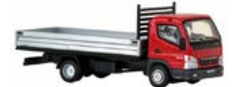
# 6419 - Mitsubishi FE, Sterling 360