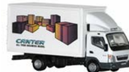
# 6470 - Mitsubishi van - white