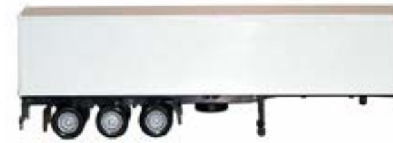
# 5405 - 40' container trailer, 3-axle # 5406 - 2-axle version, # 5407 - Container only