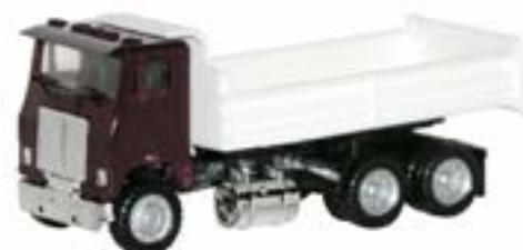
# 6298 - White dump truck