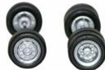
# 5448 - Low profile truck wheels