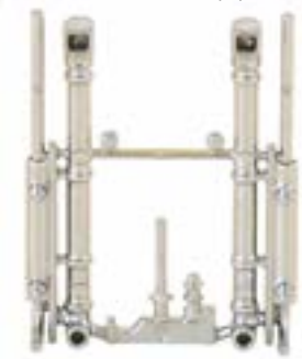
# 5425 - Package of 2 heavy-duty stacks