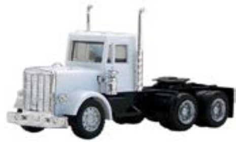
# 015232 - Peterbilt, short chassis, white