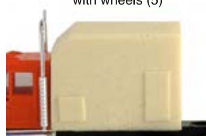
# 5422 - Large sleeper, resin