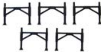
# 5388 - 5 stands/sand shoes